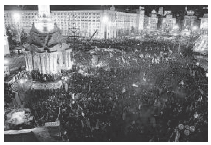
Taras Shevchenko Face on Maidan